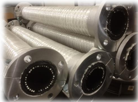
Ceramic lined hose, fiberglass cover c/w aluminum split flanges 150#

The hose is lined with ceramic balls vulcanized to a high abrasion resistant rubber compound. The ceramic ball design insures wear and impact resistance, also allowing a good flexibility.