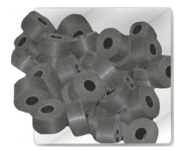
Lathe cut neoprene pieces

NOTE: flanges can have ANSI 150# or 300# drilling, DIN drilling or any custom design