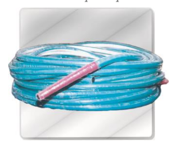
Papermill washdown hose c/w built-in nozzle