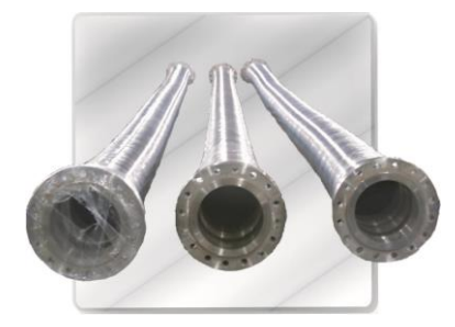
Petroleum hoses c/w stainless steel nipples & flanges 300#